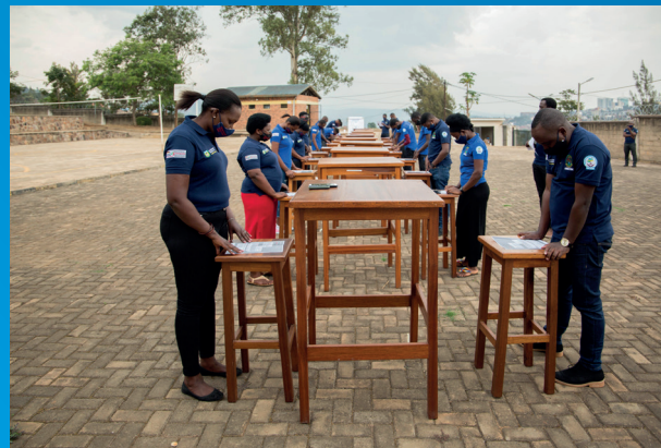
Participant's speeddating in Kigali, ESS 2020